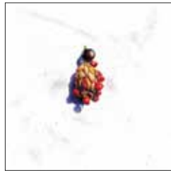
Hope (47), Sweetbay Magnolia/Magnolia Virginiana, colored pencil on illustration board, 16 x 16"

For Fantini, the role of seeds is extraordinary and magnificent and an integral part of all planetary life—a point that Fantini's keen scrutiny and impressive skills amplify in a precious homage to life itself.