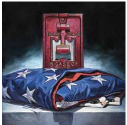
Broken Glass , oil on canvas, 48 x 48"