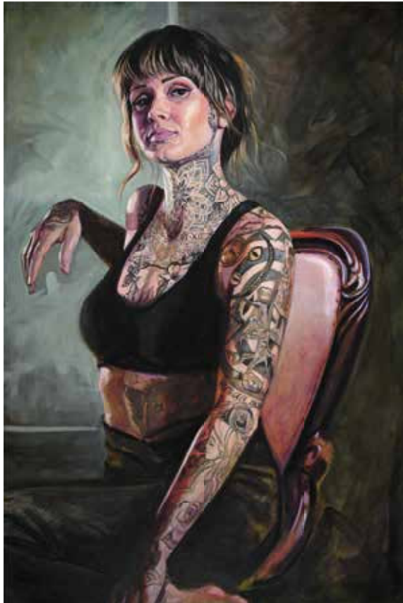
Down the Rabbit Hole , oil on canvas, 60 x 40"